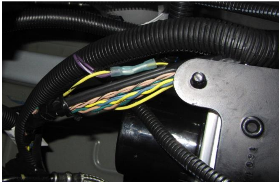
Figure. 62 Splicing LS Purple/White (Speed) to OEM Yellow/Black Wire at ABS Actuator (located under the cab, beneath the driver seat).